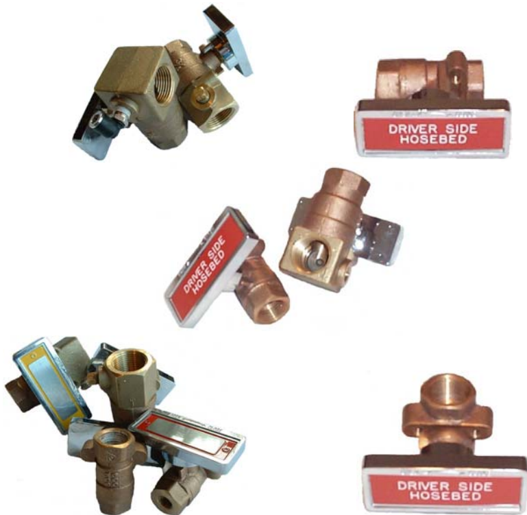
PANEL MOUNTED VALVE TEMPLATES

BLEEDER AND COOLER BALL VALVES. INCLUDING CHROME PLATED HANDLE WITH 1" X 3" RECESS FOR ADDING I.D. TAGS. INLINE (STRAIGHT) OR 90° DESIGNS ARE AVAILABLE.